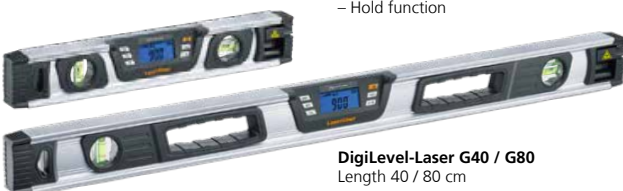
DigiLevel-Laser G40 / G80 Length 40 / 80 cm